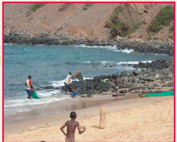
Fishermen shake out their nets on the beach.