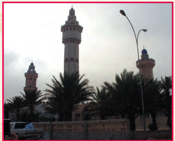
The mosque at Touba is the burial place of religious leader Cheik Amadou Bamba.